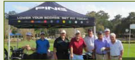
Golf Members with Ping Staff at recent Demo Day