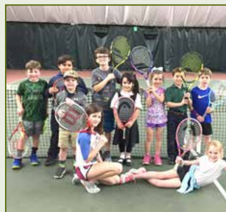
The Grinders Class great group of kids with some spectacular points.