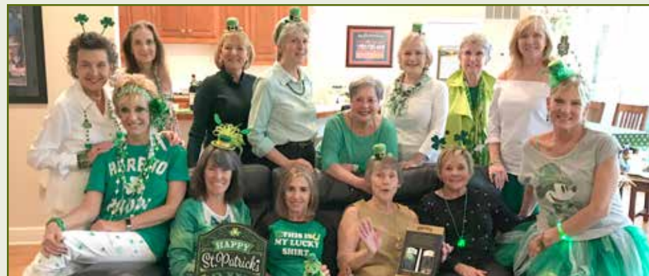
Northlake Senior Team "they know how to celebrate St. Patty's Day!"

As always please feel free to call or stop by the tennis desk for more information. We're happy to help!